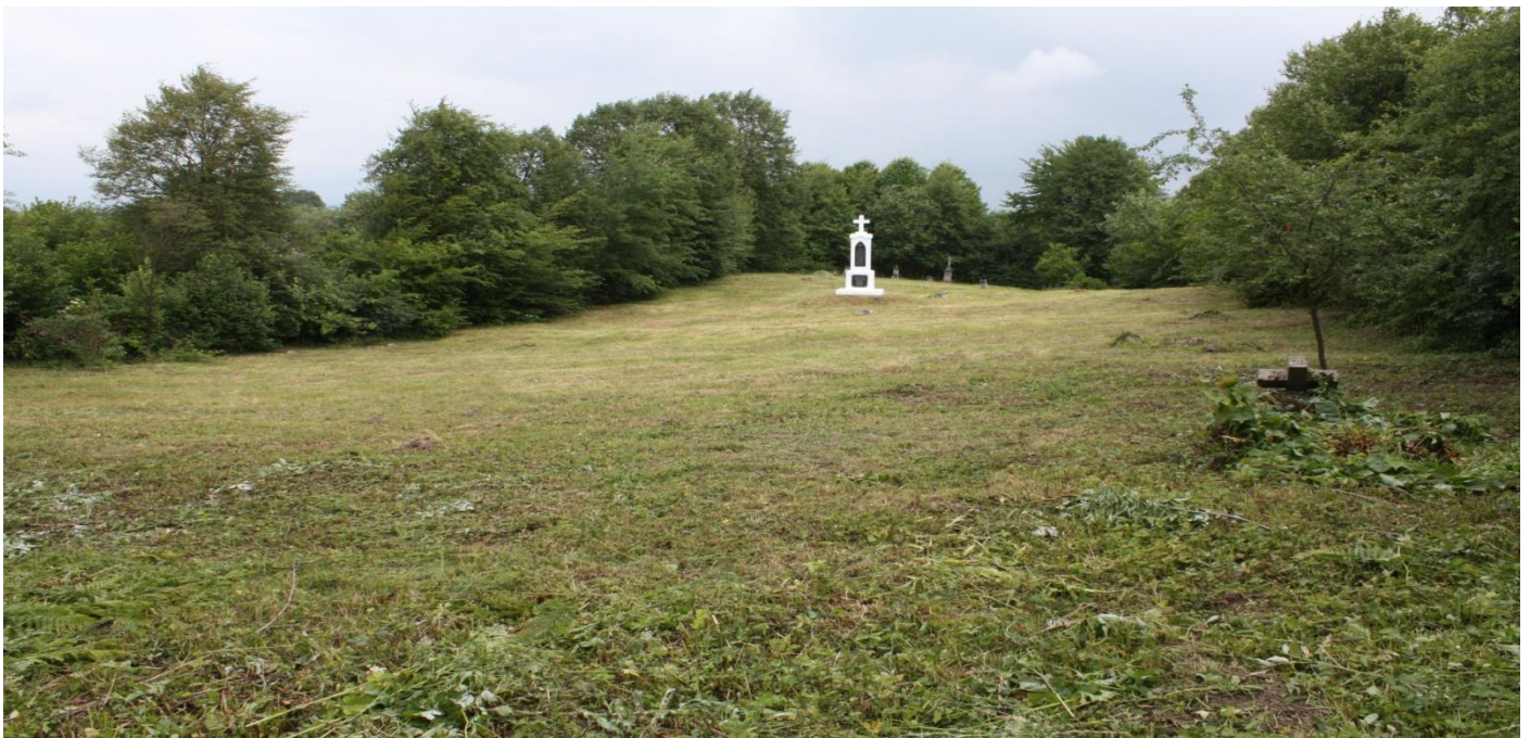
Photo taken from south-west corner of cemetery in June 2017.