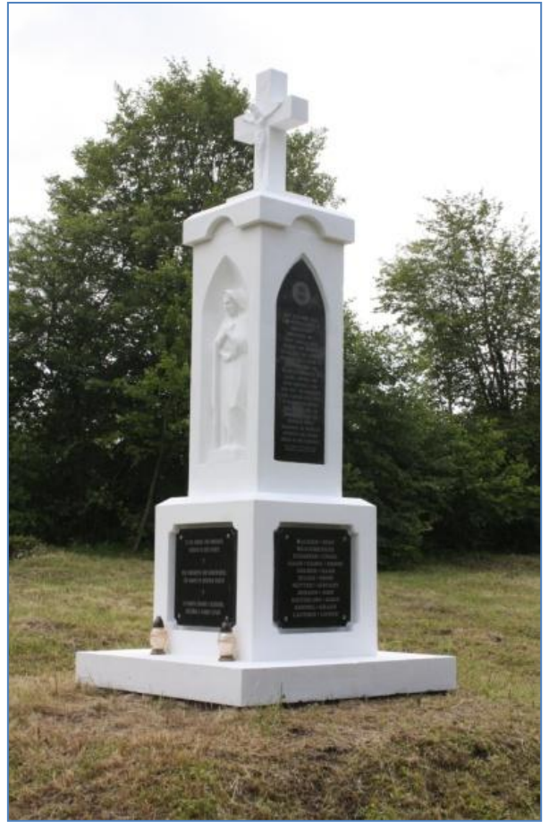
Monument Erected in Muzhylovychi German Colony Cemetery. The monument stands four meters in height and rests on a small earth mound in the centre of the cemetery.