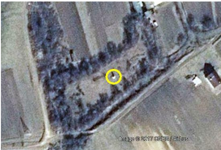
Muzhylovychi German Colony Cemetery Today. The white dot in the center of the cemetery is the new monument located in almost the same spot as the large cross in 1853. ( GoogleEarth )